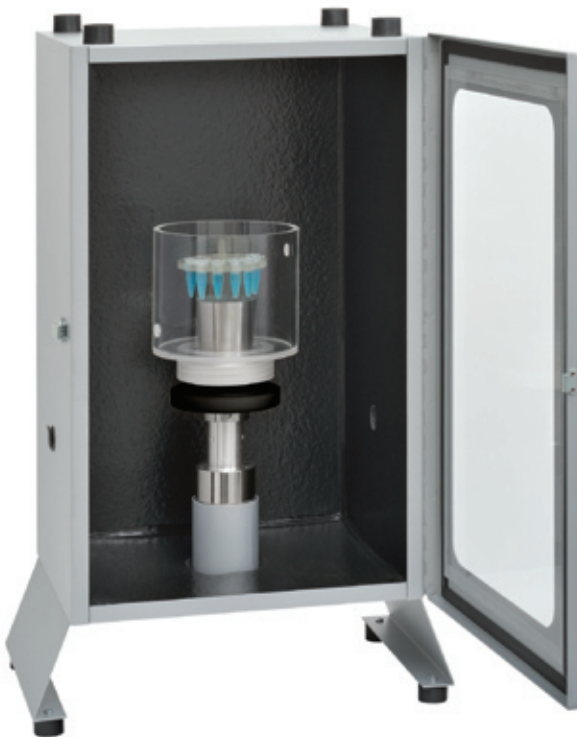
432B with cup horn