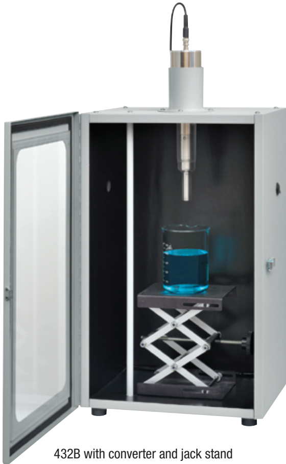
432B with converter and jack stand (Jack stand sold separately.)